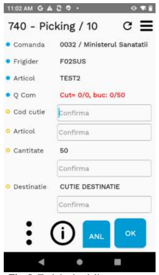
Fig. 8. Task in the delivery process

The Box Code field is the first that the user must scan, being represented by the label applied on the box during the reception process. If the quantity is smaller than the one in the box, it is out of stock. If it is equal to the available, the box ceases to exist (it is deleted from stock) but continues to exist in the warehouse. An error is displayed if the user enters a larger quantity than the one in stock. The Item field is filled in by scanning the barcode received from the manufacturer. The quantity is entered manually by the operators by pressing the corresponding numeric buttons on the keyboard of the mobile device. If a box containing fewer units is scanned than is required to be delivered to order, a new load is automatically generated for the remaining unprocessed quantity. The user continues by scanning another box and entering the amount he takes from it. The Destination Box field is the last scan in this delivery step. Like the reception process, labels containing integer, consecutive and positive numbers and their barcode are applied. The software system