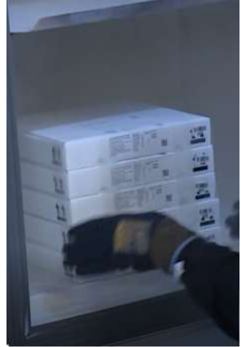
Fig. 1. The first doses of vaccine provided by Pfizer

Military Research-Development "Cantacuzino" in Bucharest, Figure 1. It is expected by a team of doctors, nurses, and IT specialists. The rules of handling and storage are among the strictest and most difficult to comply with. To cope with the rigors of the Army and to accommodate all the particularities of the different types of vaccines, a logistics software system was developed. It was used from the first reception and in all deliveries that followed it.