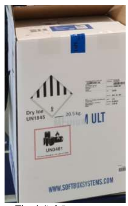
Fig. 6. Soft Box transport

into the reception area. The staff of the Institute, using the front-office application, receives the products. With the physical completion of the takeover of the goods, it confirms in the application, an event that causes the change of the order status in Completed . The physical reception consists in the handling of the Soft Box, Figure 6, from the supplier (Pfizer, Moderna, AstraZeneca), their sale and the effective handling of the vaccine doses to the storage spaces. In this process, special scanning head devices are used to read the barcodes written on the transport boxes. These automatic readings reduce the time when vaccine doses are not in the optimal storage range (for Pfizer, between -80 ^{\circ} C and -60 ^{\circ} C1, for Moderna at -20 ^{\circ} C, and for AstraZeneca between 2 \circ C and 8 \circ C ). ° C).