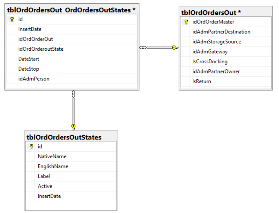
Fig. 5. Orders States Tables

tblOrdOrdersOut_OrdOrdersOutStates table. The representation of this tables is listed in Figure 5 (tables are simplified for easier understanding).