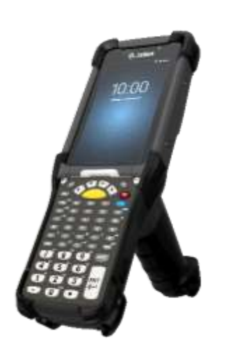
Fig. 4. Mobile device used in logistics processes

confirms compliance with all rules for handling and storing vaccine doses, regardless of the supplier, and provides accurate information on their full traceability, from receipt to delivery. Each of these three modules connects to the centralized server application. It is based on web services.