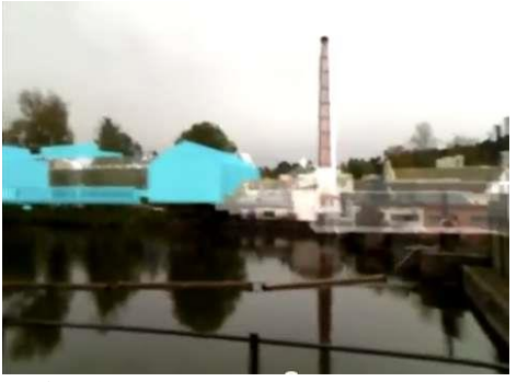
Fig. 1 Raseborg & Jätkäsaari[19]

The most common use of AR is in overlapping a real place with virtual objects. A growing number of AR applications allow you to visualize the building's building steps, from early design to construction. The visual exposure of the model through the MAR transmits in an intuitive way the appearance, scale and intentional design features proposed by team members. It is ideal for urban proposals, where a project is communicated to a large number of people, and MAR applications avoid traditional patterns of technical presentation of construction plans, reducing communication errors between design professionals and those affected by the planning process [18].