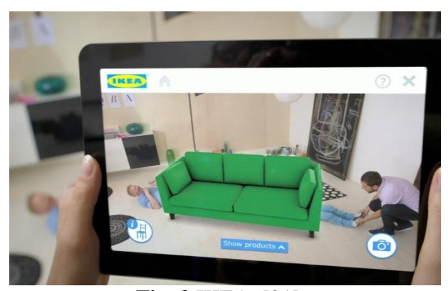
Fig. 3 IKEA [21]

and detecting overlaps between the proposed virtual content and the actual elements [20].