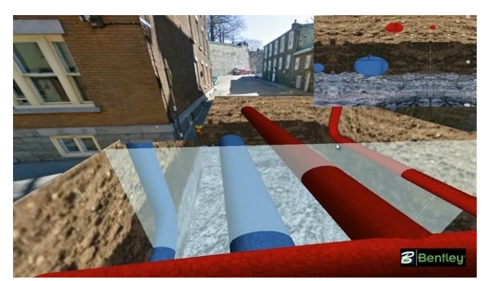
Fig. 6. Revealing Hidden Data - Visualizing Subsurface Utilities [25]

information required by ARs can improve onsite safety.