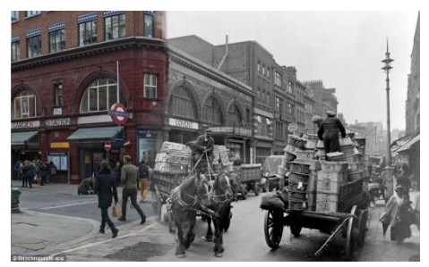
Fig.5. Street museum Apps[23]

limited sphere of communication of the architectural narrative in today's professional practice, but opportunities abound through educational uses and cultural events. Visible City's Vancouver Museum (2013) (Fig. 4) presented users with a virtual exhibition of city history, aiming at the growth, decay and revival of the neon in Vancouver. Application users may stay at hotspots set up in the city and see historical images appropriate to their locations.