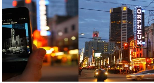
Fig. 4. The Visible City [22]

MAR applications can transmit architectural details by overlapping information inaccessible to the viewer over a building or architectural details. In applications for cultural heritage, MAR applications show virtual reconstructions of historical sites that have degraded over time. AR allows users to view historical artifacts without touching or degrading them.