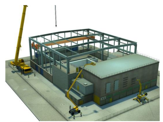
Fig. 7. MAR to plan Virtual Construction Work Sites [26]

AR can extend the 4D planning of design and logistics planning to the construction site. MAR applications can overlay virtual objects on physical planes to communicate dynamic component behavior or to overlay virtual objects directly to detect potential factions of real-world equipment. Industrial manufacturers operating in closed environments are pioneering the use of AR to better understand their factory processes and maximize the use of production space.