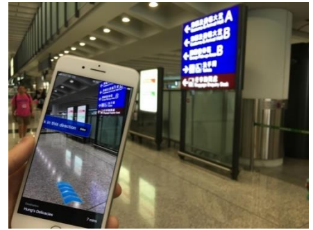
Fig. 10. Copenhagen Airport [29]

The interior of Copenhagen Airport (CPH) (Fig. 9) and (Fig. 10) has since 2011 been the first airport in the world to use MAR to help passengers navigate inside it (because GPS positioning is commonly used for geo-based external applications -location, and the GPS cannot be reliably used inside). The CPH application uses the airport's Wi-Fi infrastructure for tracking.