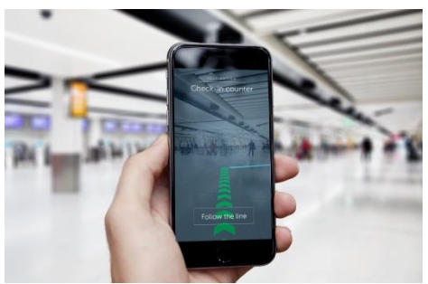
Fig. 9. Copenhagen Airport [29]

The Cyber navi application (Fig. 8) shows the route to be followed by a live video that makes it possible to understand the intersection and the surroundings, measure the distance between vehicles, detect signal modification, etc. by real-time video analysis. Also, there is a "road creator" function that generates real-time road data and can use it to make routes that are not currently recorded in the application [28].