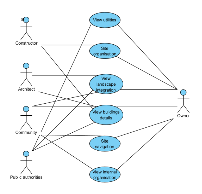
Fig. 11. General Use Case

one when the building enter in use. The application will support the understanding of the building project before the construction works are launched and will be useful for construction professionals as well as for those who are not specialized in this field.