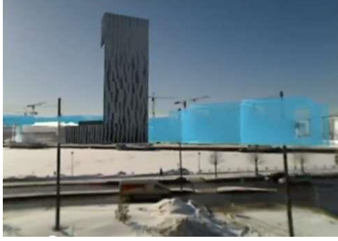
Fig. 2 - Kämp Tower Tours [19]

AR was used in 2011 in Finland to design a hotel complex (Fig. 1), the project being addressed to local authorities for approval. Within the project, a virtual tour of the complex was available using mobile devices. The audience noted that using AR helped to estimate the volume of the building better than other methods and helped them understand the construction plans.