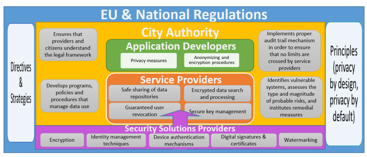
Fig. 2. Security measures for a smart city – an onion model

In order to adequately protect a smart city, a lot of measures provided by various actors are needed. An overall view of these solutions is presented in figure 2 and describe in the following part of the paper.