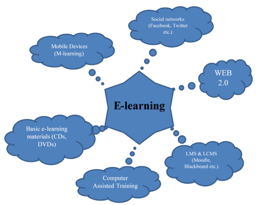
Fig. 3. Basic components of e-learning

Implementing the e-learning module in such a manner as to allow mobile applications to connect to it via Web-Services, XML or other ways that make live exchanges of information between the mobile application (Android, Windows Mobile, iOS or other) will benefit both the students and the tutors. Some of the benefits [26] of approaching elearning through m-learning are: