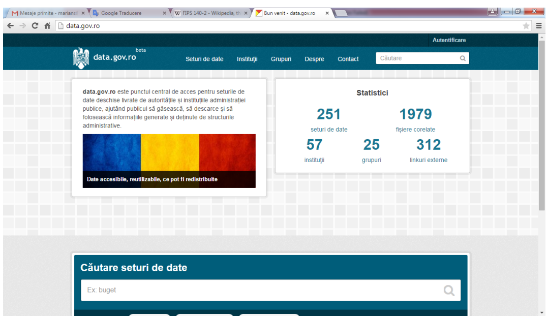
Fig. 4. Open Data portal of Romania government

The equivalent of this British initiative in Romania is <a href="http://data.gov.ro">http://data.gov.ro</a> (still in beta version for now – see Figure 4), that follows a similar model. Through the 2013-2016 Government Program, with the support of Department of design and Online Service, citizens are empowered to "identify, download and use data sets the are public or owned by public administration" [4].