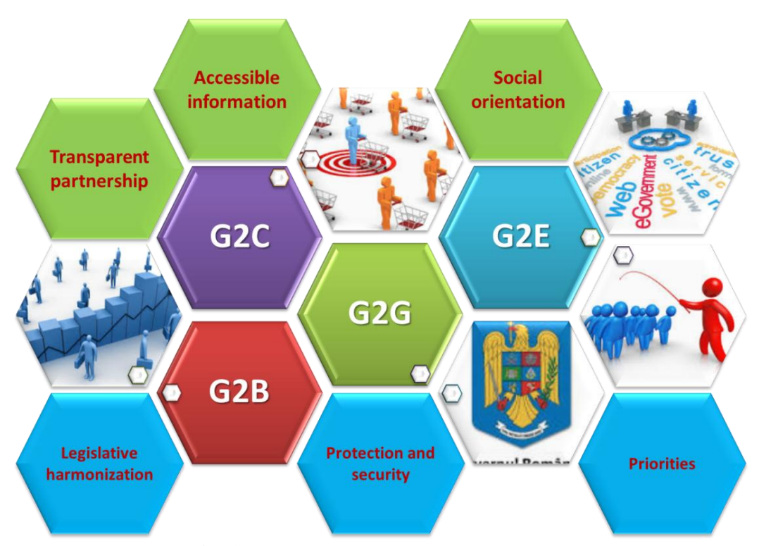
Fig. 2. Principles of electronic government

methods of ensuring information security; F. Priority for political, economic and social dimension against the technological aspects.