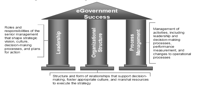
Figure 1 The "Three Pillars" of eGovernment

In order for the governments to reap the full potential of benefits of e-Government, a number of conditions, a number of building-blocks, are necessary: leadership, connectivity and network readiness, business environment, human capital, privacy, trust and security: