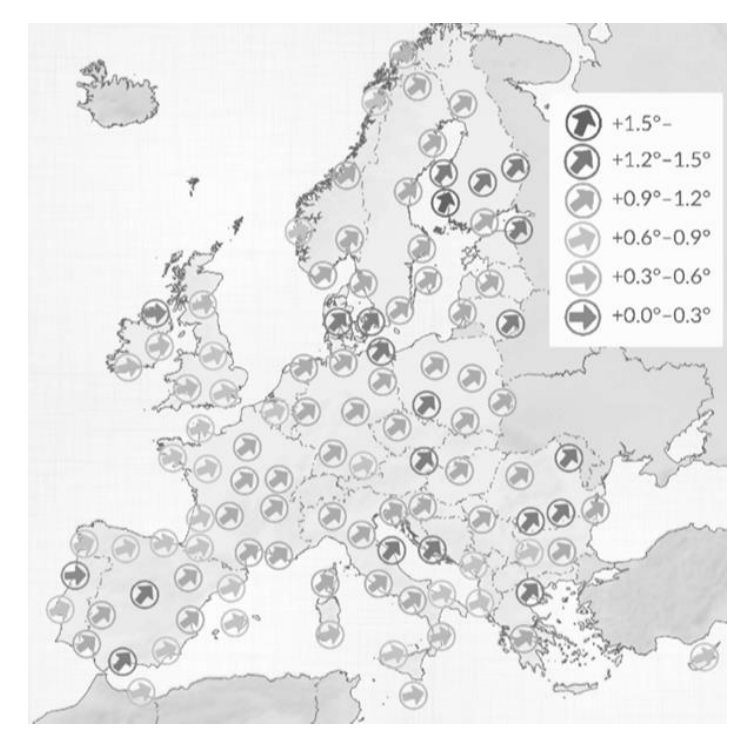
Fig. 7. The increase of average temperature across in EU the years [26]

To give details on the major aims that were mentioned above, there are several policy areas where this programme is to intervene. The CEAP II (Circular Economy Action Plan) was adopted with the main focus of boosting global competitiveness, to generate new jobs and to sustain the economic growth. It covers all the full cycles of products: production, usage, waste management, and the market for derivatives, aiming to keep resources in economic cycles as much as possible (the power of circling longer). The idea of Regulation on Eco-design refers to the way the products are designed, so its main aim is to make product more reparable, easier to maintain, more upgradable, reliable, reusable, and energy and resource efficient. Moreover, all the products will better inform the consumer of the environmental impact they have. The Farm to Fork strategy wants to ensure that aquaculture, agriculture, and fisheries contribute appropriately to the objective of climate neutrality. The forming of an environment that makes is easier to choose sustainable and healthy lifestyles regarding food consumption will benefit consumers. The 2030 Biodiversity Strategy is an ambition long-term plan that wants to protect the degradation of ecosystems. Along with the circular economy, it is a